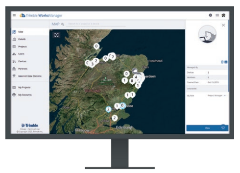
Ensure all your projects are on track with an account level map