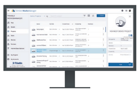
Effectively manage data on field devices - updating and archiving designs and projects