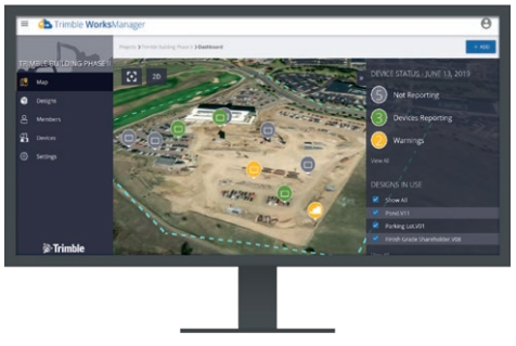
Intuitive dashboard shows your digital assets and design information