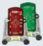
956 / 956G Optically Enhanced Target