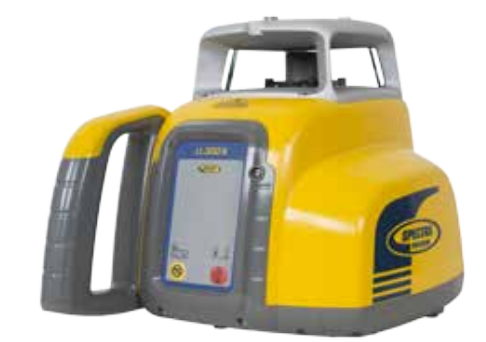
LL300N features a strong metal sunshade

© 2014, Trimble Navigation Limited. All rights reserved. Trimble, the Globe & Triangle logo and Spectra Precision are trademarks of Trimble Navigation Limited, registered in the United States Patent and Trademark office and in other countries. All other trademarks are the property of their respective owners.